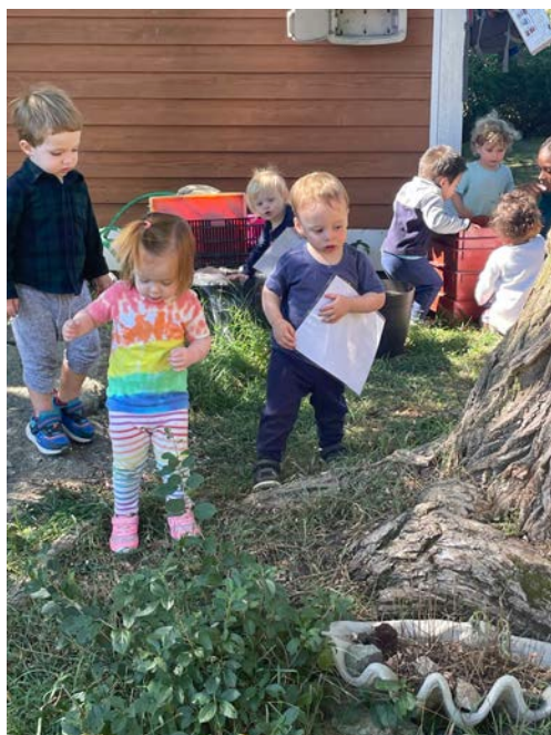
The Explorers search for bugs by the tree!