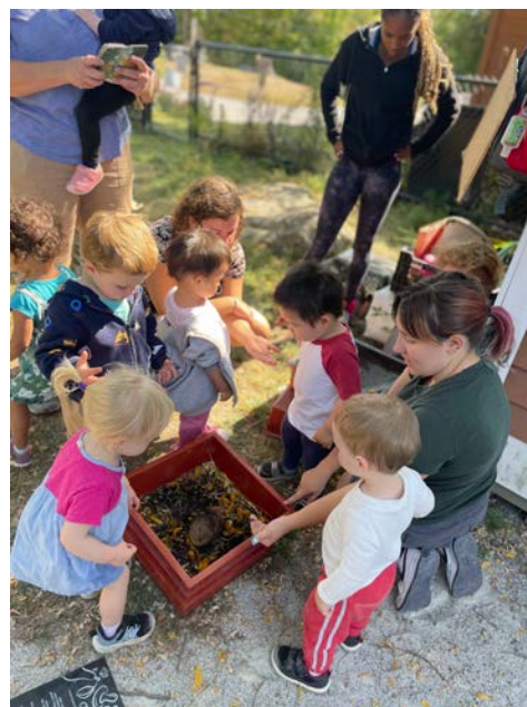
Getting a close look at our worm factory!

to us. Then we mixed the castings with water, and everyone had a blast sprinkling the fertilizer on our garden with watering cans!