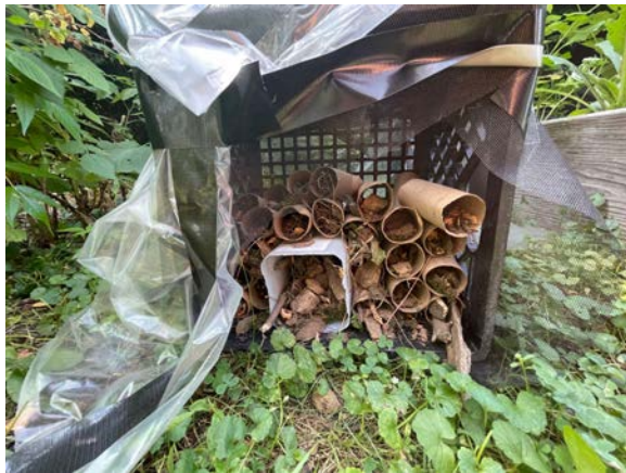
Our new hotel is now open!

After the project was finished, the newly constructed hotels were placed in different spots in the garden for a variety of bugs and insects to occupy as shelter, thus promoting more biodiversity within the Firefly Scientist Garden space. As part of a celebration, the Garden Team invited all the students to help harvest some more tomatoes that have ripened over the past week, and observe other vegetables that are currently growing in the garden.