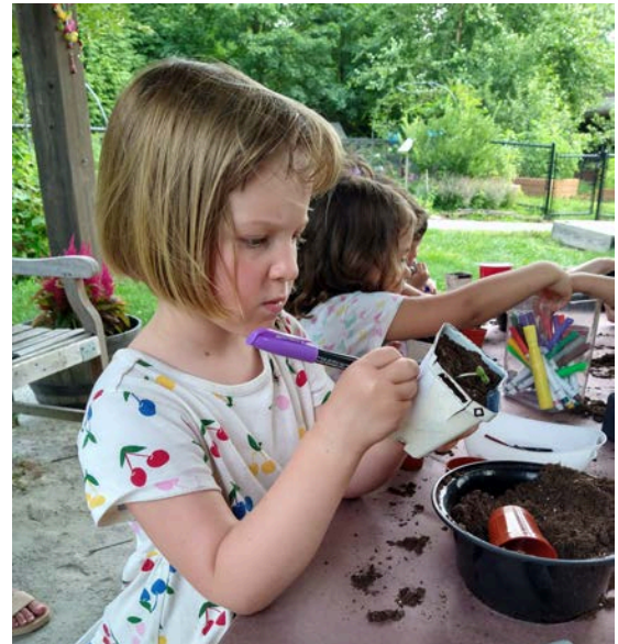
I'm going to write my name on it!

The Garden Team has prepared some germinated hibiscus and sunflower seeds for friends to put into pots! For the activity, the students put soil into their individual containers. They received either a hibiscus or sunflower seed, depending on their preference, and covered it with more soil. With a teacher's help, the students also watered their seedlings and decorated their pots, which will be put into our greenhouse. Although we could simply put the seeds into the garden beds, the greenhouse provides more protection for our seedlings from the weather and animals in the garden. We are so excited to see these little seeds grow!