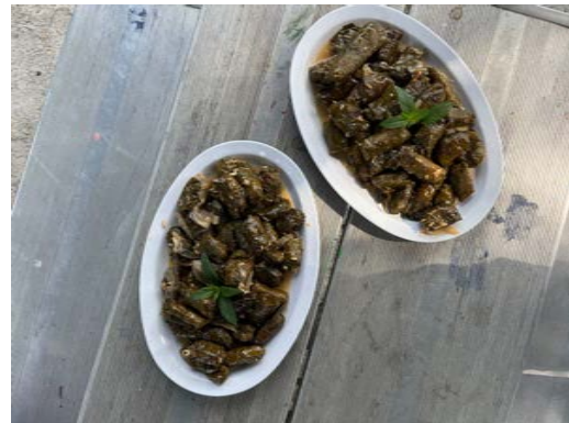
Stuffed Grape Leaves!

mixture of rice, tomatoes, parsley, onion, lemon, and spices. The filling was then wrapped in boiled grape leaves harvested from the grape vines in the garden. For the mint lemonade, the Garden Team had lemonade that was then blended with mint leaves that were harvested from the garden.