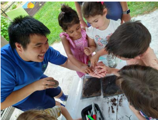
Sprinkle the seeds on the soil like you are salting some pasta!