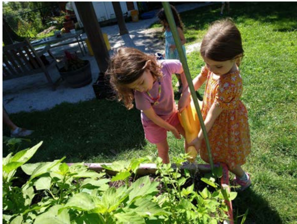
Helping to water our vegetables!