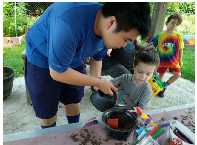
The seeds need water, too!