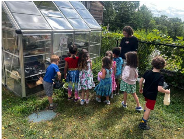
Everyone is helping water our plants!

The students and teachers enjoyed everything the Garden Team served. With the garden activities coming to a close for the summer, it was only natural to end it off by tasting food that the team and students had worked so hard to grow and create.