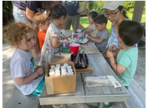
So many beads!