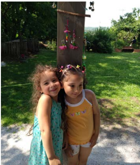
Look! That's my string!

Instead of using crayons and paper, how else can we capture the blooms and beauty of the summer? For our first activity this season, we constructed wind chimes to hang around the garden and playground areas. It was awesome to see the mixture of colors, textures, and patterns that friends used to make their strands!