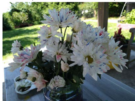
Look at our pretty flowers!

In preparation for the Fourth of July, we had a flower-dyeing project as our second activity this summer. The Garden Team prepared containers of water mixed with drops of food coloring and friends were really excited to see all the different dyes. The students were each given white flowers to dye whatever color they wanted. Before finishing up, they all left their flowers in the containers with red or blue food coloring to soak up the dye overnight and make the white petals festive for the holiday!