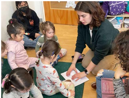
Covering up the mushrooms to see the print

The Navigators, Voyagers, and Pathfinders had the opportunity to get up close and personal with some fun guys... Well, we mean fungi! We read We are Fungi and discussed the vast variety of fungi. We talked about the mushrooms we like eating, the mushrooms that could hurt our tummies, and the mushrooms that we use as medicine. We learned that some mushrooms help trees and some hurt trees. That some mushrooms grow on fallen leaves or dead wood or old food.