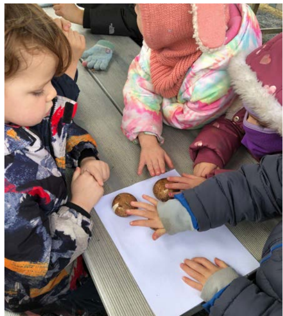
"The mushrooms smell a little like dirt!"

After finishing the story, we examined mushrooms, asking questions like how do they feel, how do they smell, what are the names of the different parts. We learned that fungi grow or reproduce from spores, so we created a spore print. We placed the mushroom caps, gill face down, on a piece of white paper and then covered them for a day. The next day, we looked underneath and found a print from the spores!