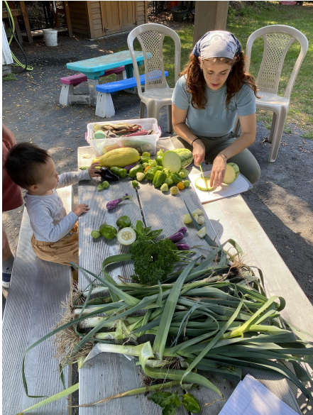
And some food for us!

We are so grateful for the extra hands, and for having a chance to enjoy a morning in the garden together. Our next garden day will be on October 8th from 9:30 to 11:30 am. Please reach out to Sylvia if you have any questions at skohnlevitt@lebergcc.org