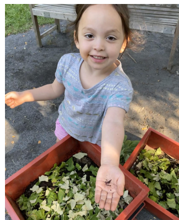
Some food for our worms...

At the beginning of September, we had a great time working together with families to harvest from our garden, feeding both ourselves and our wiggly worm friends! These worms are hard at work making our food and garden scraps into gardeners' gold, worm castings!