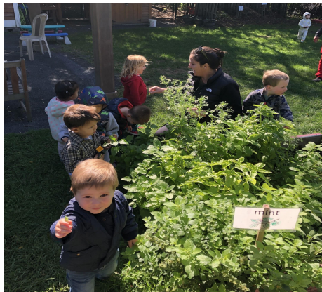
Trying herbs together

Environmental Education at The Lemberg Children's Center