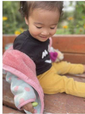
Enjoying a mouse melon