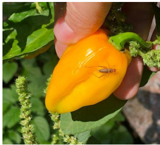
A bug cozying up to a pepper

Garden their home. Looking around the garden, we found many bugs hidden in plain sight - sitting on a plant, crawling in the dirt, or flying through the air.