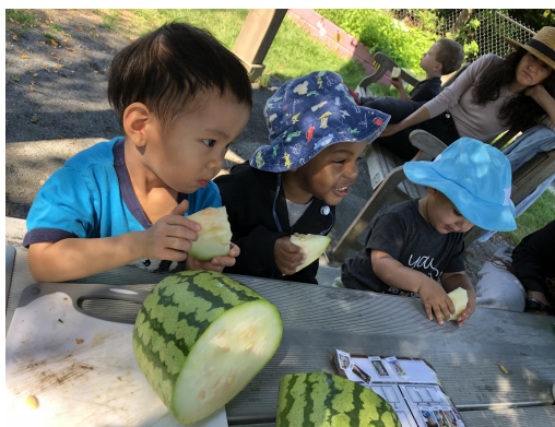
Tasting our watermelon

We have also tasted lots of fruit together. The watermelons growing in the garden were so exciting that we had to open them up! The picked melon had not yet turned red, but even a green watermelon was a tasty and refreshing treat. We all thought it tasted a bit like a cucumber.