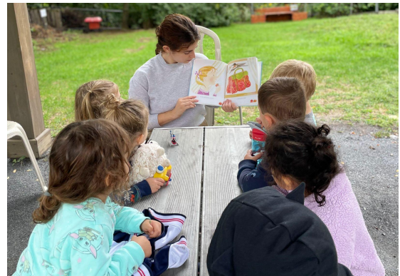
A fruit is really a suitcase for seeds!

Before venturing out into the garden's bounty, our classrooms gathered around and listened to A Fruit is Suitcase for Seeds , a story about how fruits (and fruits we call vegetables) hold the seeds of a plant. We discussed what plants need to grow and how the seeds come in different sizes and shapes.