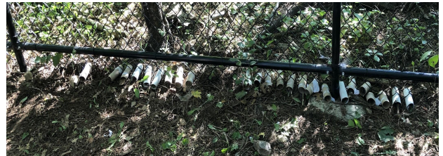
Our finished row of bug hotels.

down, helping to foster habitats for beneficial insects in our garden space.