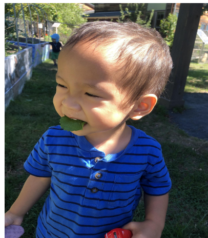
It can be hard to chew when you're busy smiling!

It is always wonderful to see how children of all ages engage with the garden. Tasting herbs like lemon balm and mint is always one of the first things we do to show friends how fun and yummy the space can be.