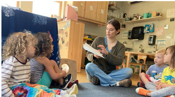
Listening to the story

Our Navigator, Pathfinder, and Voyager friends started their school year off with a tasty first lesson in the garden - identifying fruits and vegetables and making yummy pesto as a dip!