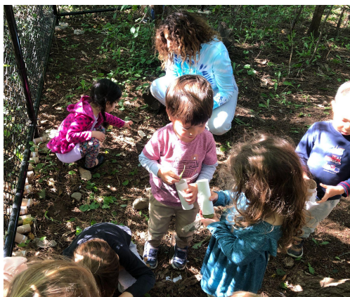
"What are you putting inside?"

We discussed what bugs need to feel comfortable, and together we created bug hotels in the Fairy garden. Gathering sticks, leaves, and rocks, we filled toilet paper rolls to make proper hotel rooms.