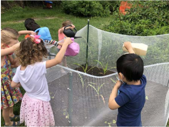
Fertilizing the Three Sisters' Garden

Environmental Education at The Lemberg Children's Center