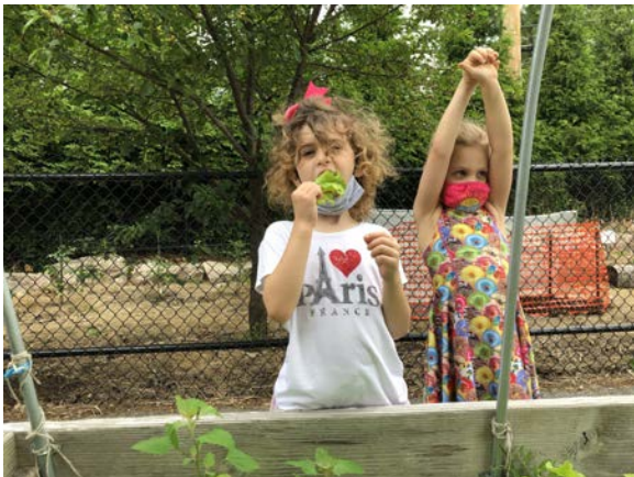
Enjoying freshly harvested lettuce

To make room for all the new planting, we harvested plenty of things: cilantro and dill, lettuce, arugula, and kale, as well as peas and borage flowers!