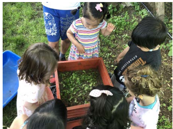
Checking the worm bin for castings to make our fertilizer

Children learned how to plant seedlings as well as seeds, how to water them, and watched them closely as they grew. They helped weed around the plants and fertilized them with castings from our worm bin so that the vegetables could grow even more!