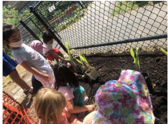
Planting corn seedlings

June has been another busy month! Corn, beans, lettuce, radishes, and marigolds have all been planted by the children.