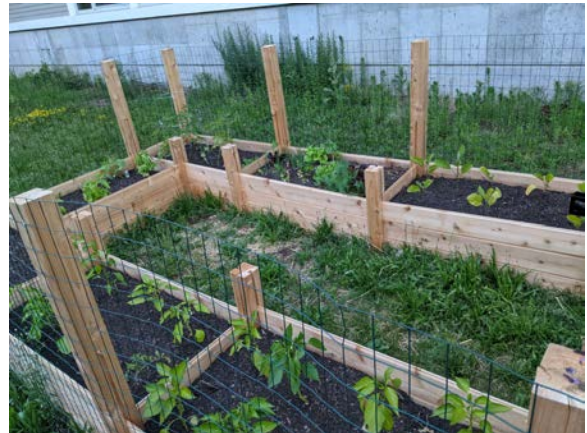
Stanley Elementary's newest raised bed

During the last few weeks of the school year, several classes worked in the Stanley Elementary learning garden, helping us to fill the new raised bed with compost, then planting tomatoes, peppers, eggplants, beans, sunflowers, and more!