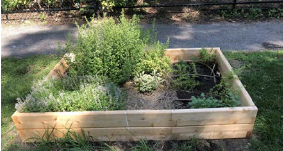
The new herb bed

Environmental Education at The Lemberg Children's Center