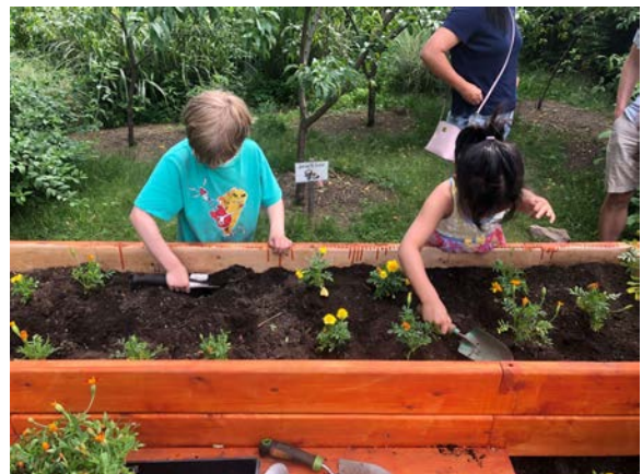
Pathfinders transplanting marigolds

Our Pathfinders had their graduation ceremony mid-June, as most of them will be moving on to elementary school this coming fall. It will be hard to say goodbye but we're so excited for them!